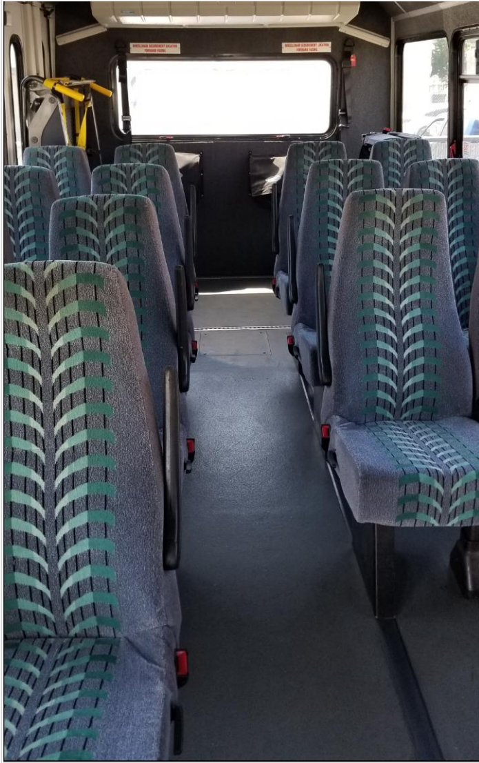
Front to back interior