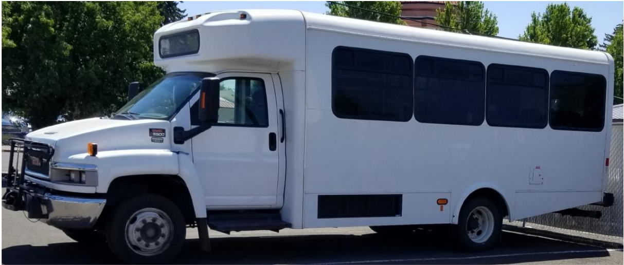
Drivers side view