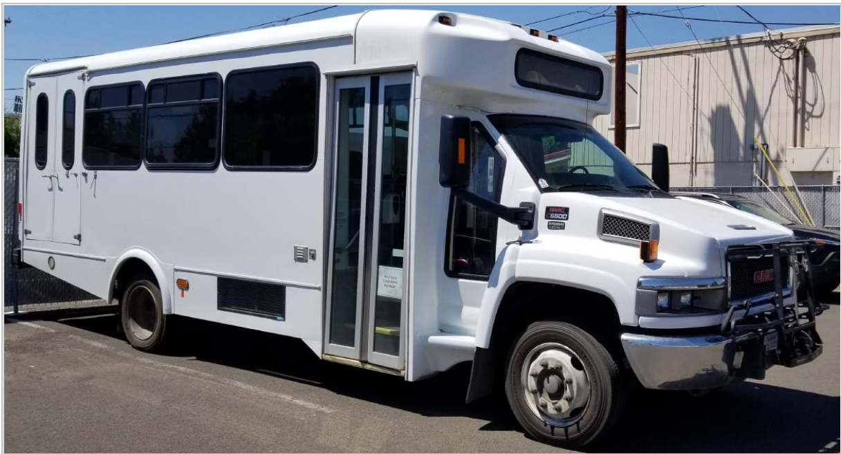
Boarding side view